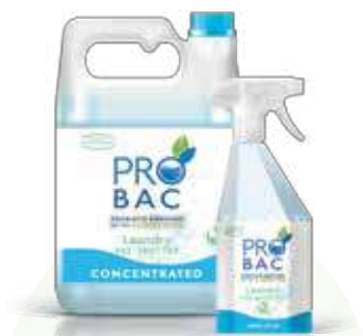
Pre-spot tough organic stains for boosted cleaning. Available in 5 L concentrate & 750 ml ready to use spray.