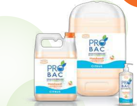
Available in 25 L, 5 L & 400 ml ready to use hand pump.