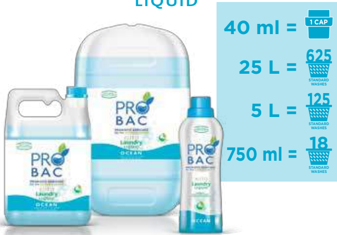
Available in 25 L, 5 L & 750 ml in use concentrate.