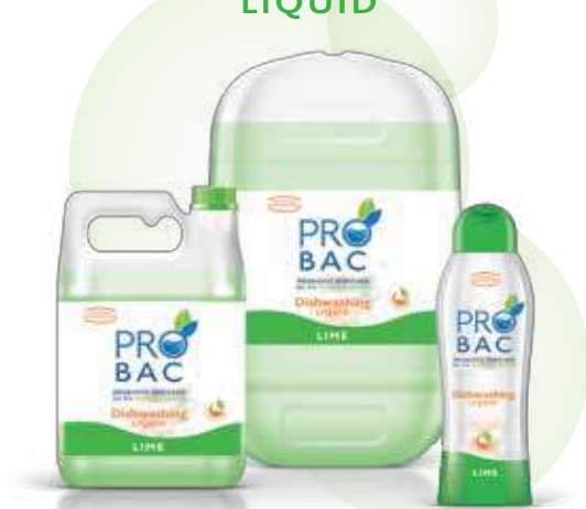
Available in 25 L, 5 L & 750 ml in use concentrate.